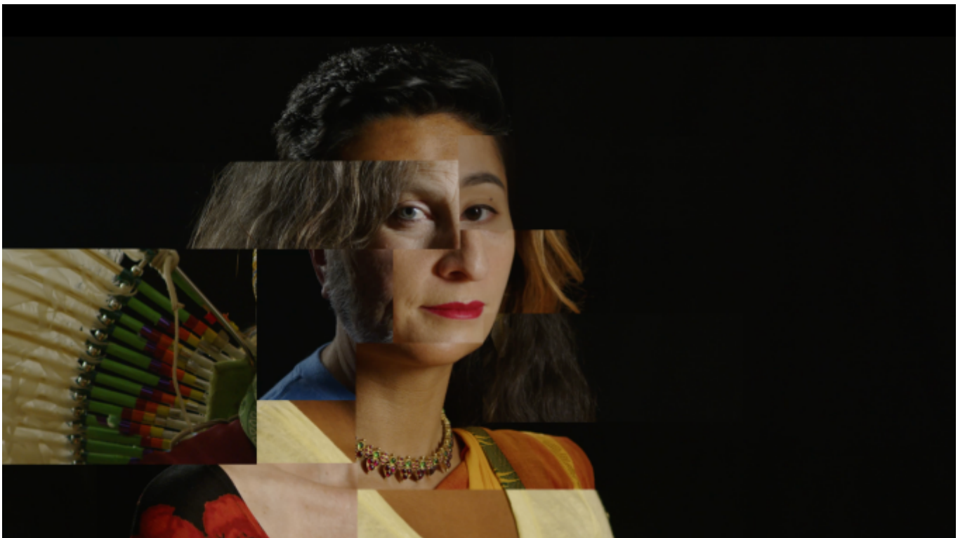
Release of In Case of Emergency dance film, Collage by Olya Glotka