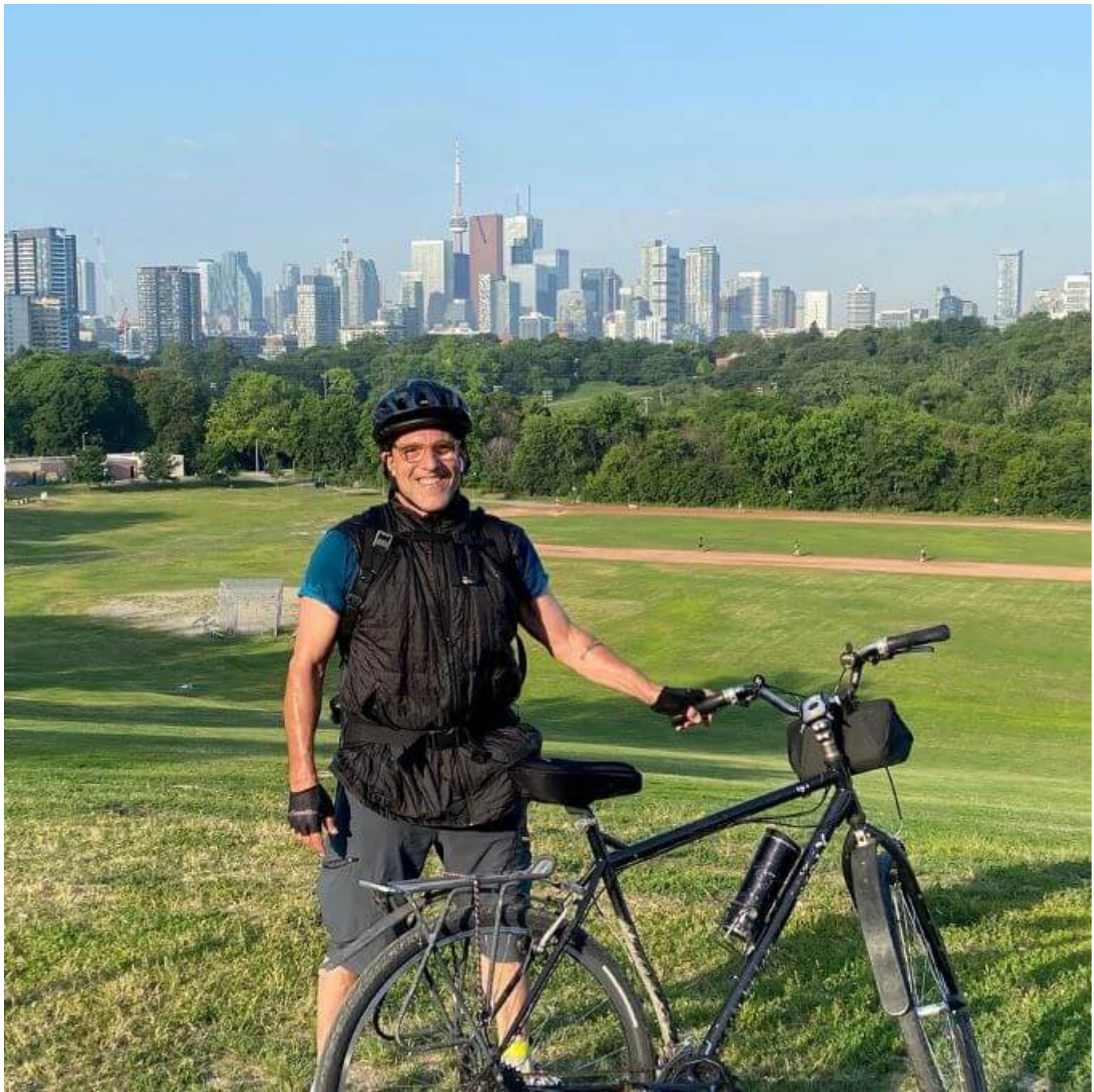
On a relaxing 63km ride throughout the city